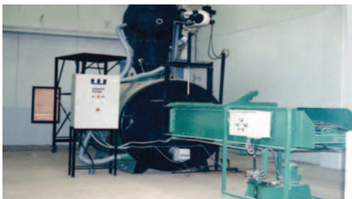
Figure 7. High temperature double chamber pyrolytic incinerator