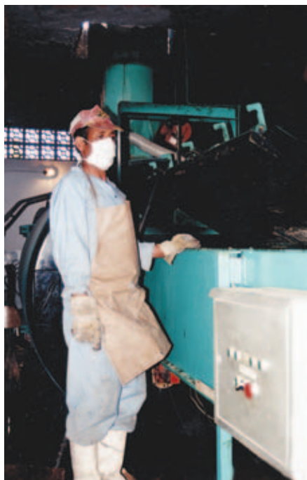
Figure 11. Protective clothing of a worker in charge of loading bagged waste in an incinerator loading device