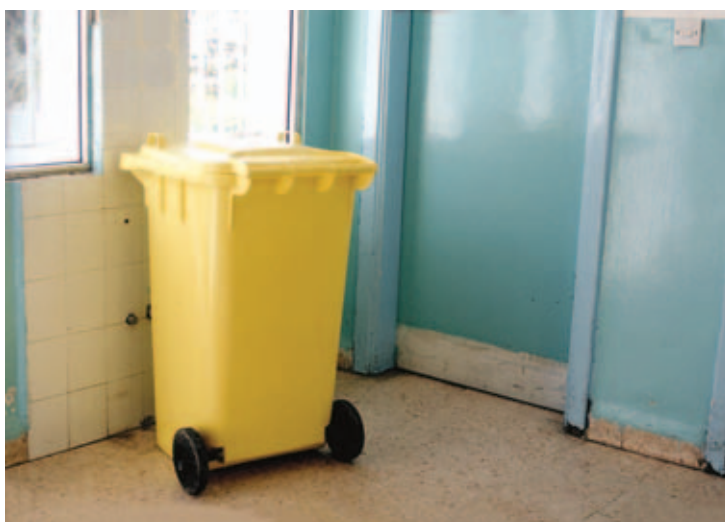
Figure 5. Example of a 240-litre wheeled container for local storage of yellow bagged waste

Removal of wastes should be according to a regular collection timetable with one or more removals from each local storage area in each working shift. If logistically possible, a further refinement would be to arrange separate routings around the health care establishment: one for patients, staff and unused medical materials, and the other for wastes, dirty linen and used materials. This is the so called ‘clean’ and ‘dirty’ system of access.