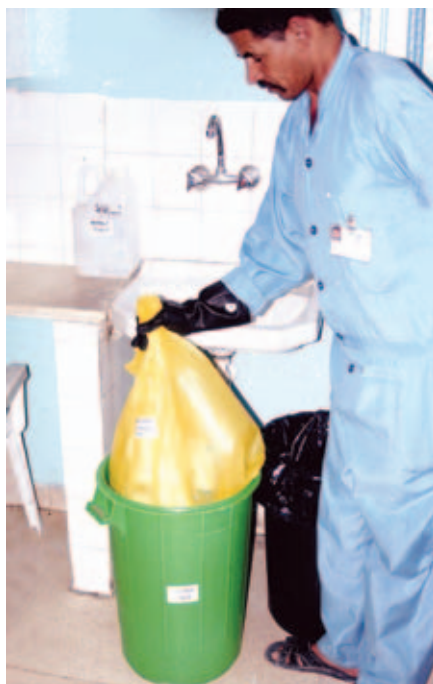
Figure 12. Protective clothing reduces the risk of infections and injuries to waste handlers