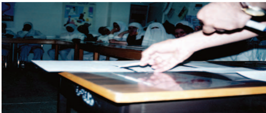
Figure 13. A training session on the one hand technique for recapping needles in a health care establishment in the Region. This technique is recommended particularly for dentists and laboratory technicians in haematology laboratories (i.e. in order to avoid haemolysis/destruction of red blood cells laboratory technicians should remove needles after their recapping)