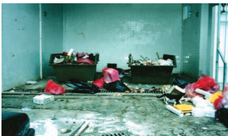
Figure 3. Central storage areas in health care establishments may provide breeding sites for vectors of many diseases (see the cat in the photo) if not designed and maintained appropriately. Separate segregated central storage areas for hazardous health care waste and general waste should be stipulated in internal procedures and rules and in national regulations

When a good health care waste system has been set up by local initiative it will quickly be recognized and respected by peers and regulators.