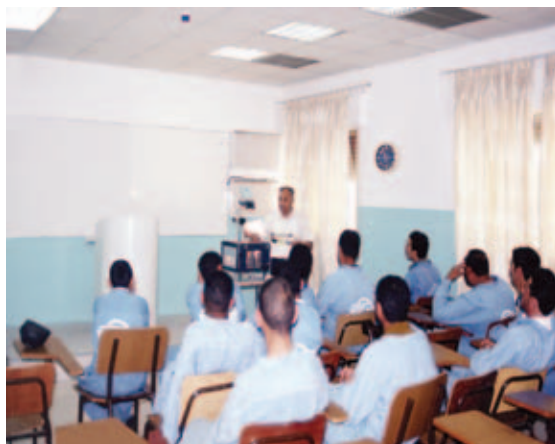
Figure 10. Training of health care waste handlers