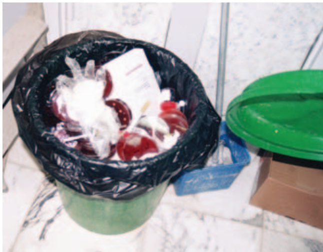
Figure 2. Petri dishes and other laboratory wastes should not be mixed with general waste. They should be collected separately and disinfected prior to joining the hazardous health care waste stream

Reuse of strong, empty plastic containers, such as those containing detergents and disinfectants, for the collection of used sharps is safer than discarding them directly into bags containing potentially infectious health care waste.