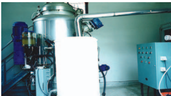
Figure 8. Steam disinfection system with shredder