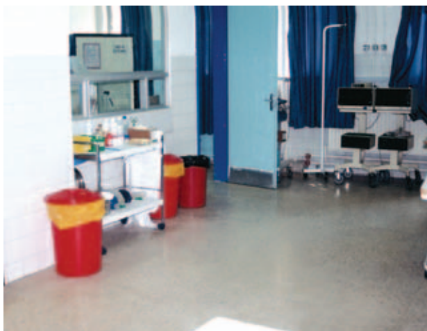
Figure 1. Safe management of health care waste and associated infection control procedures are necessary to avoid secondary infections in health care establishments