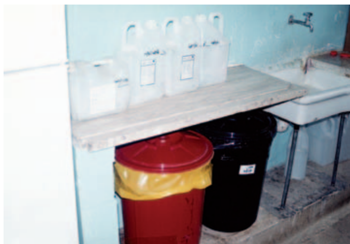
Figure 4. Three bin-system: yellow bag for potentially infectious wastes, black bag for general wastes, and leak-proof and puncture-proof reusable containers for used sharps with statements “Do not fill above the line” and “ sharps waste”

The segregation of general waste, potentially infectious health care waste and used sharps into three containers is known as the three-bin system (Figure 4). At a minimum reusable containers manufactured in different colours (or painted different colours), without disposable plastic bags, may be used to segregate these categories of