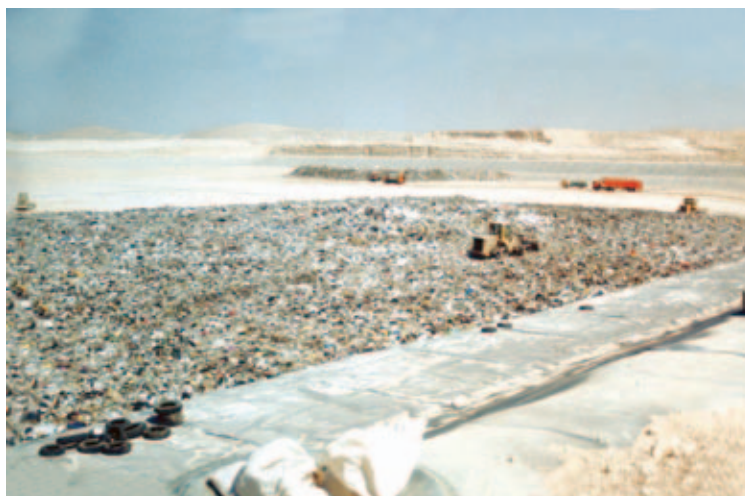
Figure 6. Example of a controlled landfill

If there is a controlled municipal landfill nearby, burial of potentially infectious health care waste each day beneath 2 metres of partially decomposed municipal waste may be a practical option. At a depth of 2 metres re-excitation by scavengers should be preventable. Scientifically, burial of potentially infectious and sharps wastes is unlikely to cause additional public health or pollution problems in a controlled landfill (see Figure 6). It is a low-cost option that could be used in those places where controlled landfilling has been achieved and where scavenging by people and animals is not present [6].