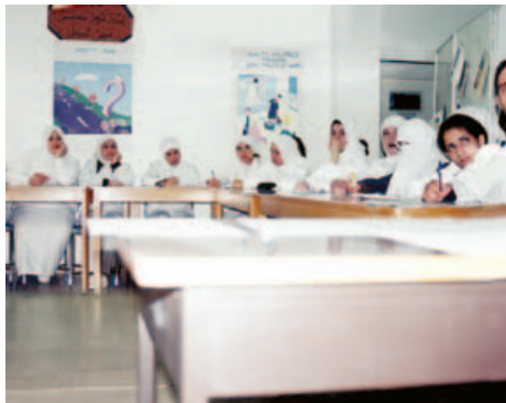
Figure 9. Training of nurses and senior nurses